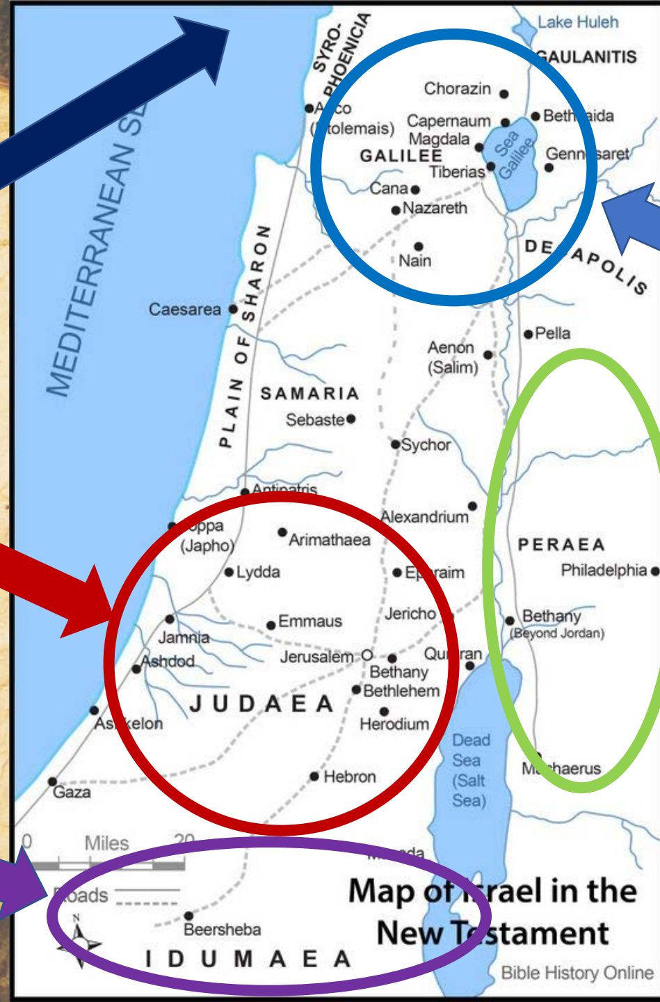
Map of Israel in the New Testament